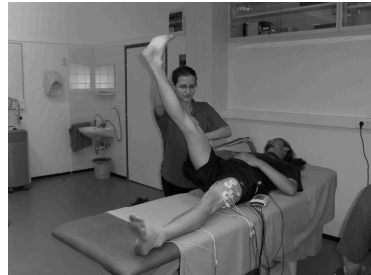
Figure 3: PNF-pattern (knee ext.)