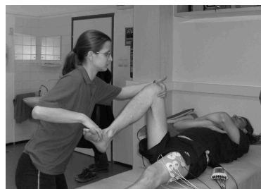
Figure 4: PNF-pattern (knee flex.)

The movement series was performed according to the principles of PNF in the right diagonal so the IPNFA determined that. The motion started with an initial stretch, it is a reflex, then our body movement followed the movement of the subject's limb, so a continuous resistance was being given.