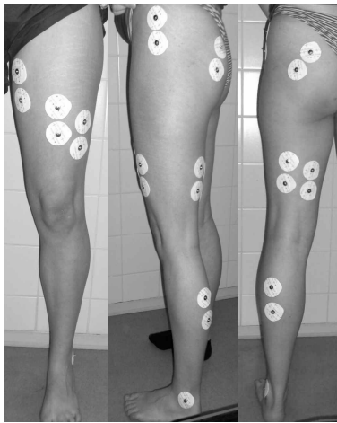
Figure 1: Electrodes arrangement

The electrode pairs were stuck parallel with muscle fibers about 25 mm distance from each other. They were fixed to the widest part of the muscle, which can be fingered the best. The raw EMG signal (Figure 2.) was detected with an eight channel Zebris Bluetooth EMG equipment, while the subject was doing the PNF pattern. The measuring instrument detected the changes of electrical potentials against the time between the electrode pairs. It could be visualised with their own WINDATA software. [9-12]